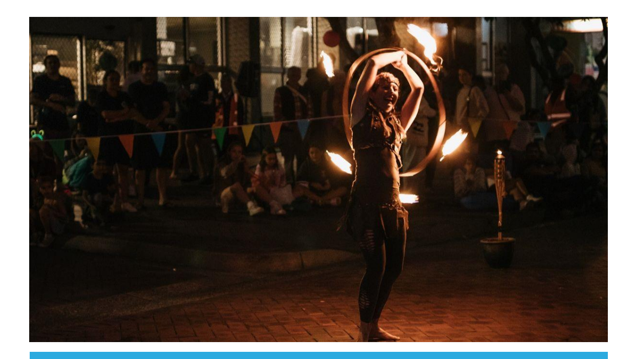
Learn more about the Vibrancy Reforms