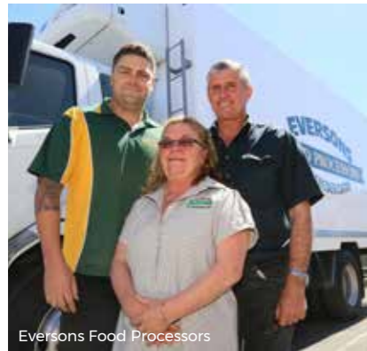
Eversons Food Processors