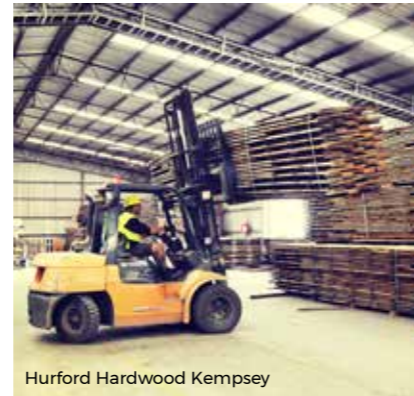
Hurford Hardwood Kempsey