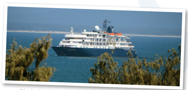
A tourism highlight of the last financial year was MS Caledonian Sky visiting Trial Bay

During the year, Council hosted a visit from passengers aboard luxury cruise ship MS Caledonian Sky who docked at Trial Bay at South West Rocks and other successful events including the