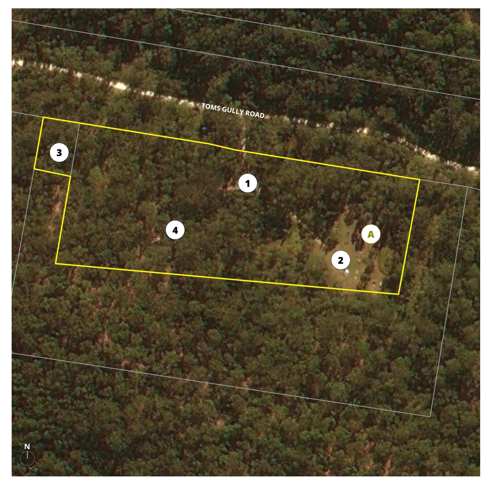
3.12.2 SITE PLANS KEMPSEY CEMETERIES STRATEGY

A. Toms Gully Cemetery – part Council Managed Crown land (Reserve 82924) and part devolved Crown land cemetery (R1000752). Sections include Church of England (Anglican), Roman Catholic and Uniting (Methodist Wesleyan).