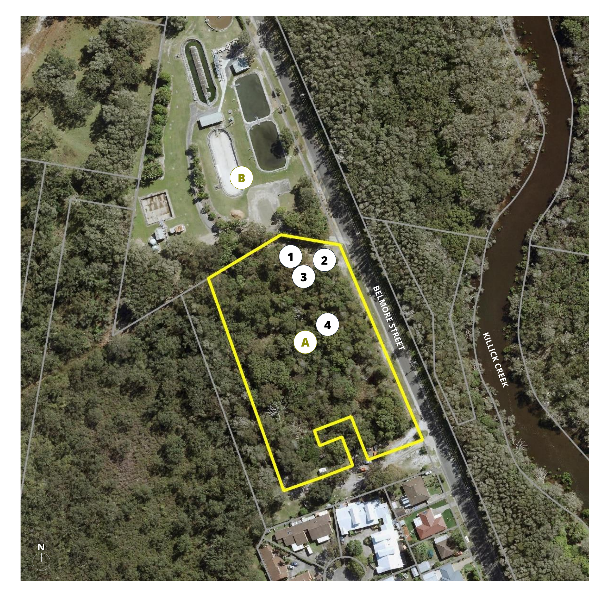
3.12.2 SITE PLANS KEMPSEY CEMETERIES STRATEGY