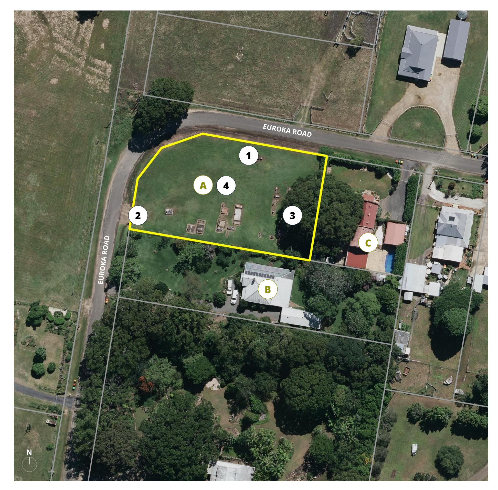
3.12.2 SITE PLANS KEMPSEY CEMETERIES STRATEGY