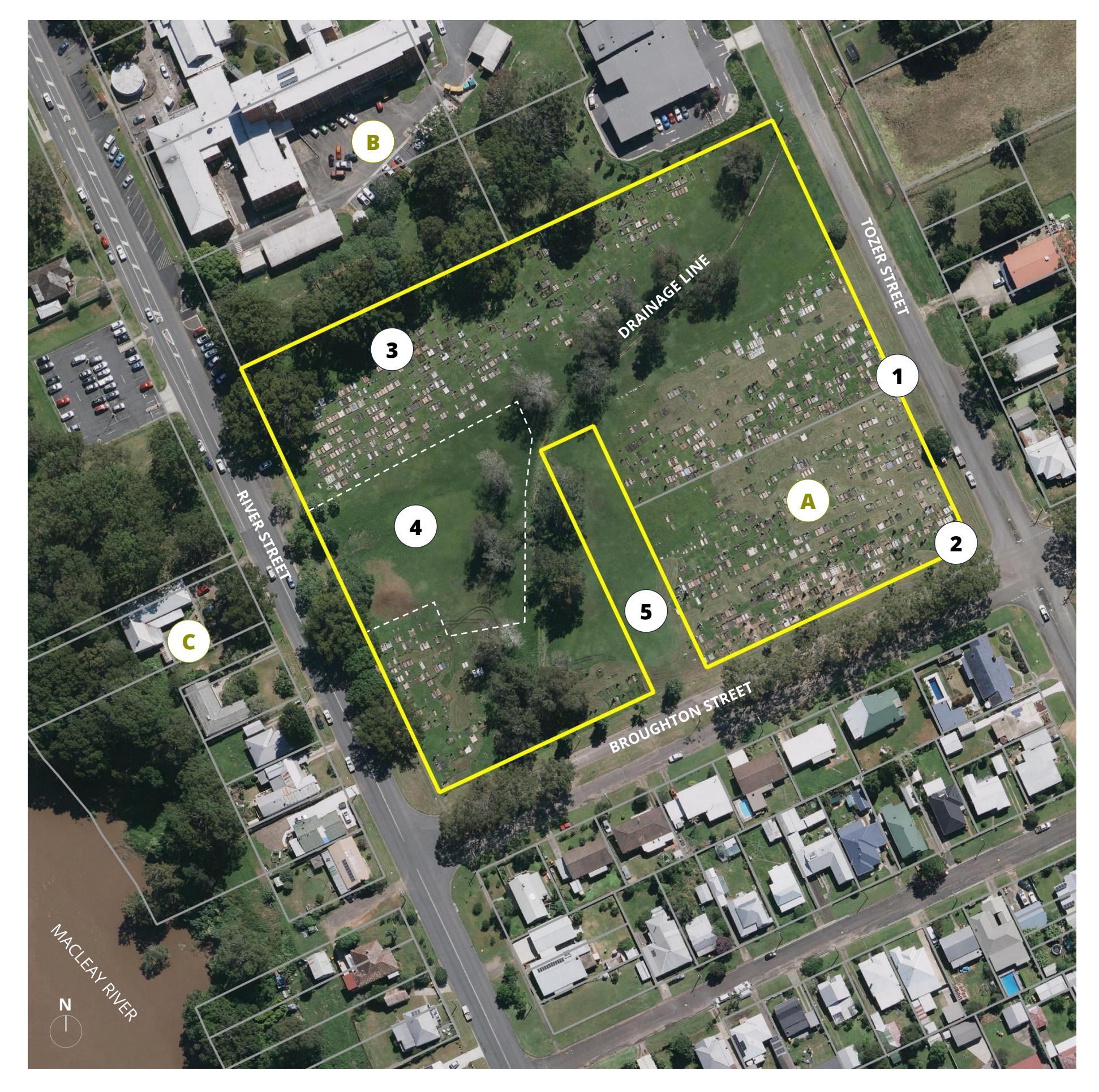
3.12.2 SITE PLANS KEMPSEY CEMETERIES STRATEGY