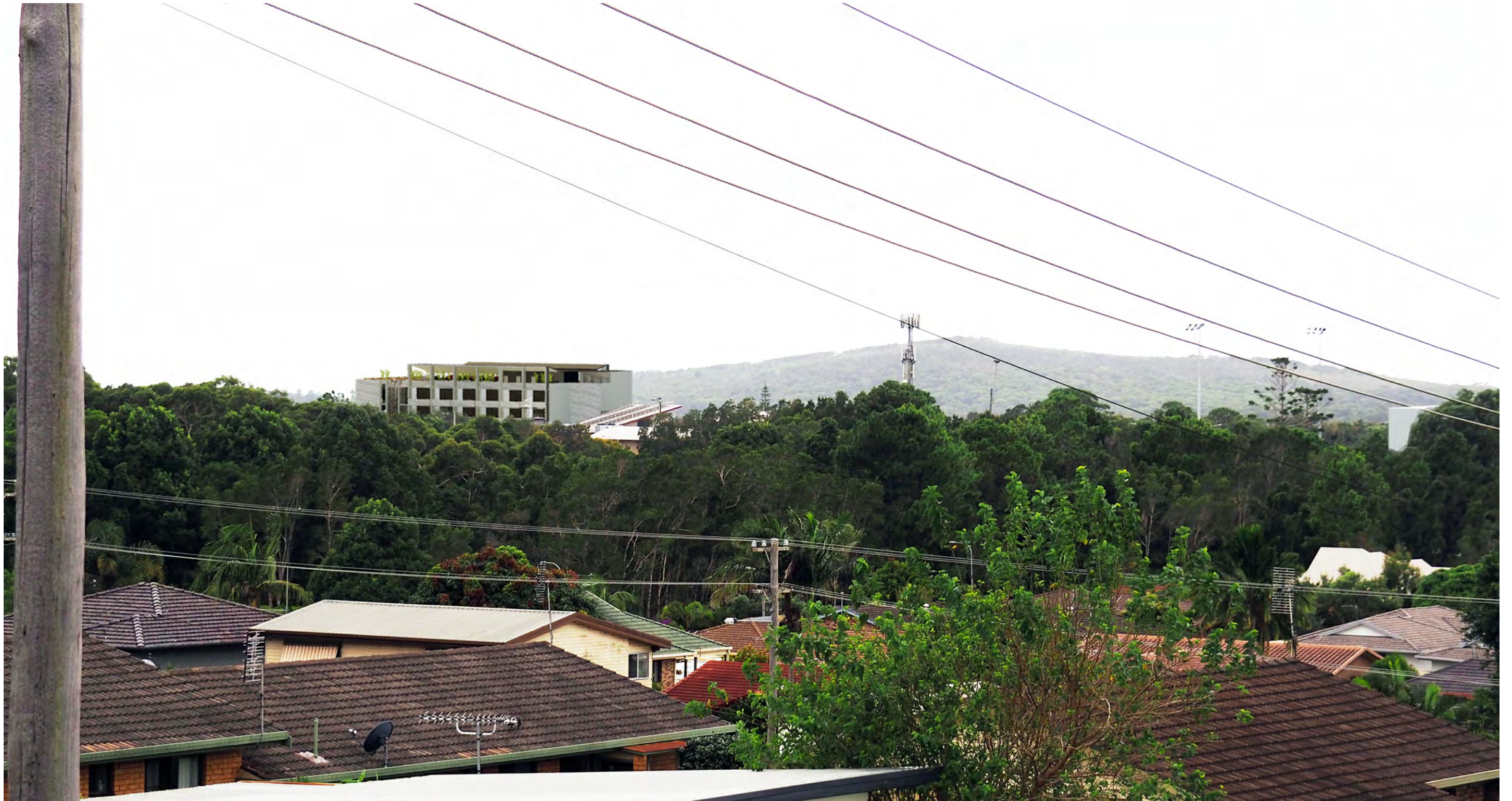
Visual Analysis - Position C with zoom lense