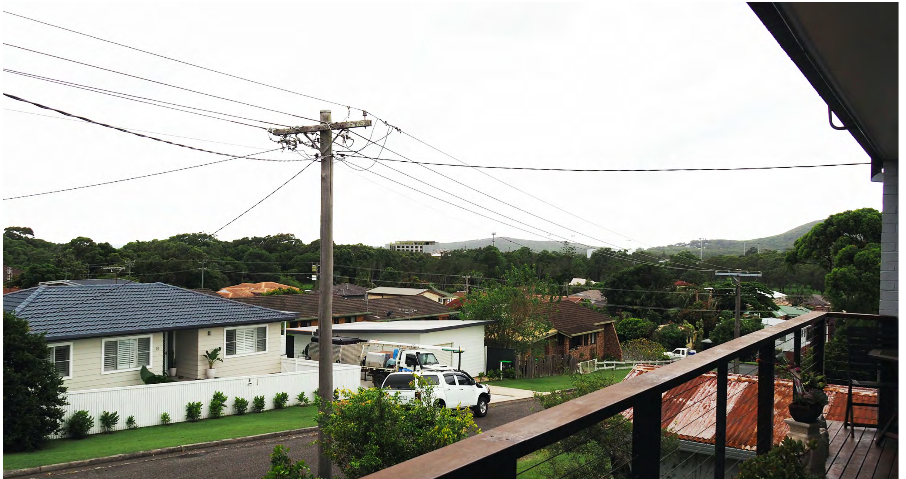
Visual Analysis - Position C with 50mm Lense