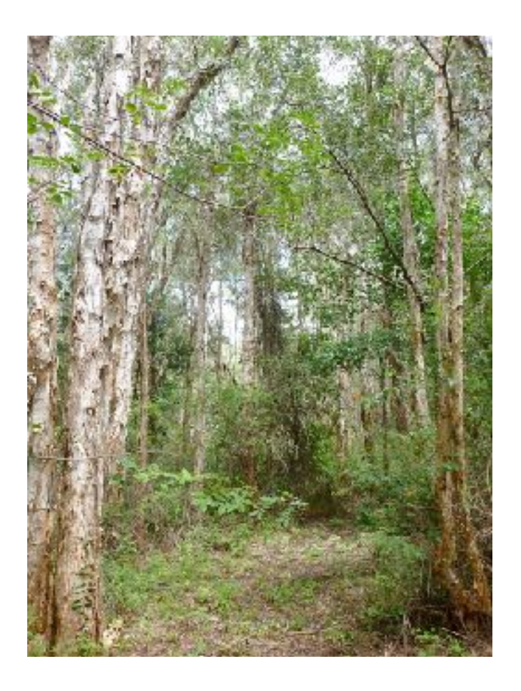
Plate Six: Off-stockpile looking east

The ground and mid storey contained sparse Lantana plants, and vines (Smilax spp.)