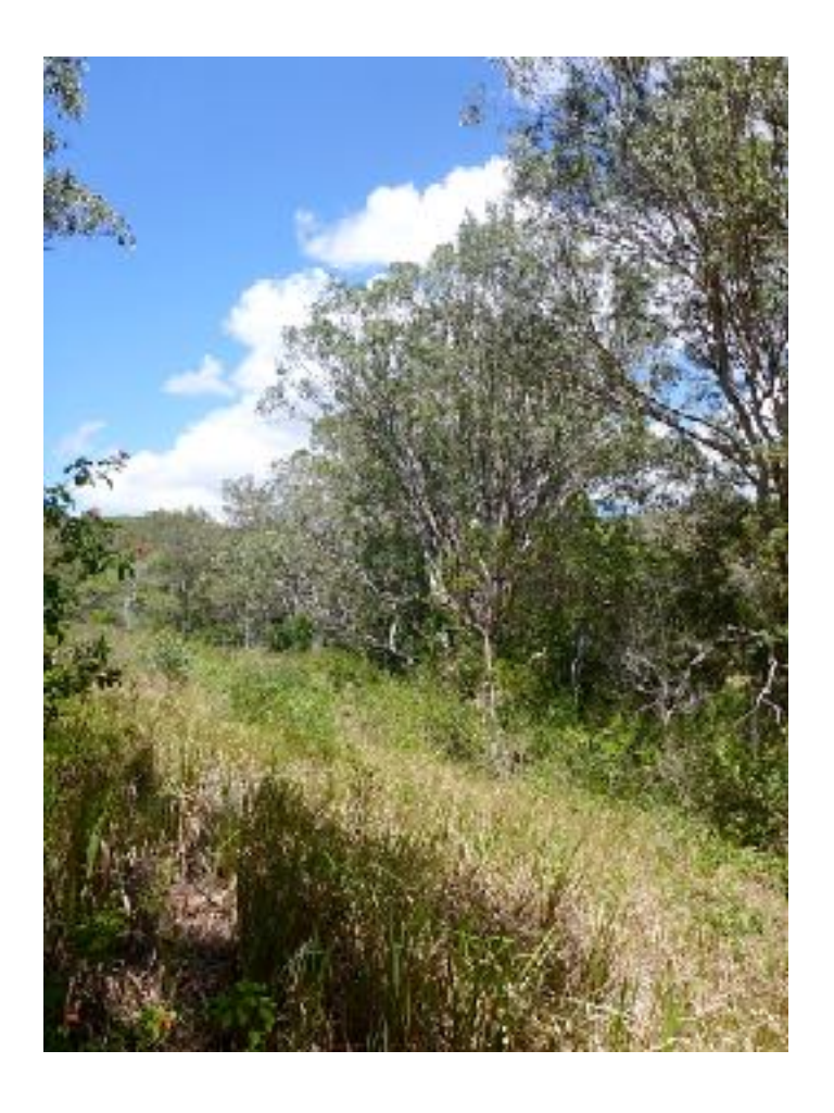
Plate Four: Roadside trees between the Point Plomer road and the stockpile looking south

E. teriticornis is present elsewhere on the site, however, not in a single age stand such as the roadside. Koala use of these trees was evident with scats, scratches and scent markings present within these trees.