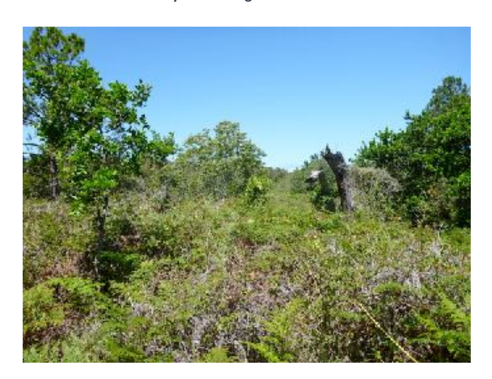
Plate Three: On-stockpile looking east

Grass species were many and varied, but were mostly represented by the native Imperata cylindrica and introduced Paspalum urvillei .