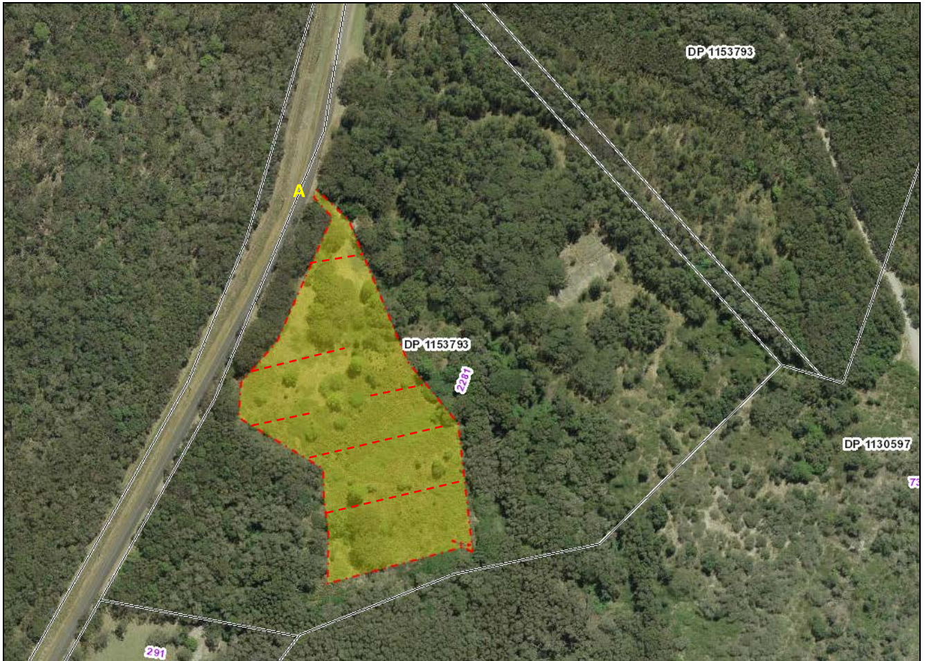
Figure 2. Area of interest approximately 1.5 Ha area within Lot 2281 DP1153793 shown in yellow. Proposed paths of prospecting (topographic survey and hand auger holes) shown as dashed red lines. Proposed access point from Point Palmer Road marked as 'A'.